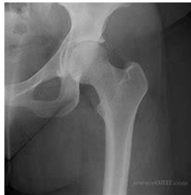
AP Affected Hip